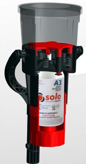
Solo 330 for use with Solo A3 & C3 Aerosols

Solo 332 is available for larger diameter detectors.